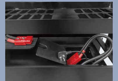
Battery side roll out and built-in charger are equipped as standard, which are convenient for battery replacement and charging operation