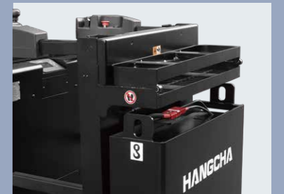
The rear load tray can be folded for working in confined space