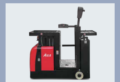
The guardrails are equipped with detection switches. The order picker cannot work until the guardrails are put down