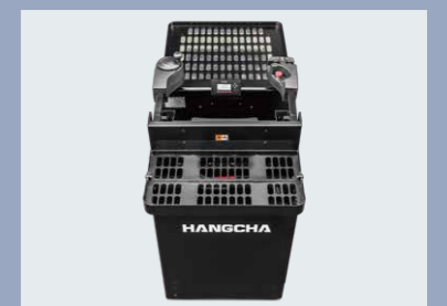
The front and rear large-size trays can greatly improve the efficiency