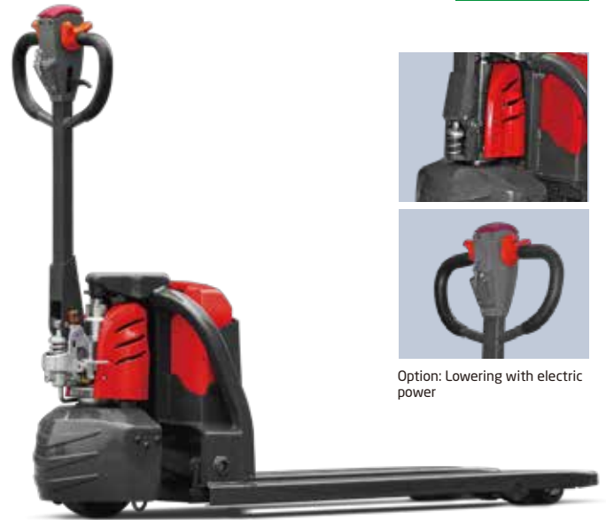
Option: Lowering with electric power