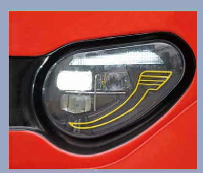
LED headlight has the head light and dipped light functions. The front turn light utilizes the latest stream light technology.