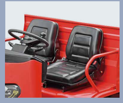
2 operators on board, optimised driving position for maximum comfort and efficiency