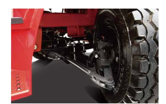
Fully hydraulic steering (4-5t)

The follow-up steering system provided for the standard configuration has the advantages of low energy consumption, low noise, light steering force, a good feel, safe and reliable steering, etc.