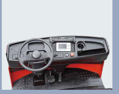
Large screen display, the instrument panel adopts injection molding design, sturdy and