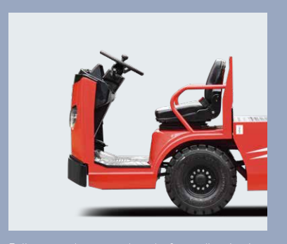
Full suspension operating platform, vibration is reduced, noise is isolated