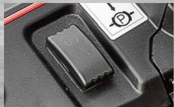
Electronic hand brake(Optional)

Inheriting the advantages of lithium battery forklifts—wide view, large operation space and excellent ergonomic design.