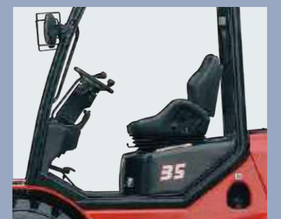
The easy-to-open hook provides quick access to the engine compartment