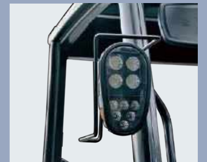
The new efficiency lighting system employs LED illuminant and new type reflector to reduce energy consumption, improve significantly illumination performance and prolong work time