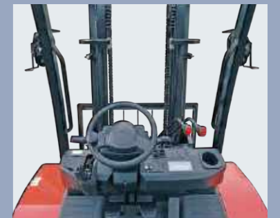
The new designed steering wheel\ new brake system and the easy-to-operate levers provide total handling operation