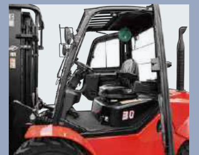
The large, spacious cab of our new boasts left and right grab handles with wide-opening doors for easy access