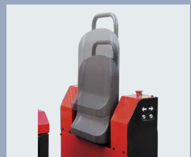
Backrest height can be adjusted within a certain range, and the backrest with hip support can greatly improve the comfort of the operator