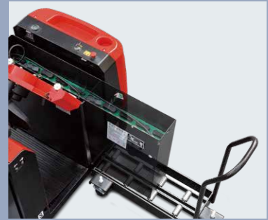
Side battery changes is standard feature