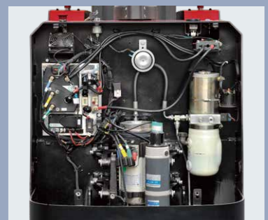
Fully opened hood, easy accessibility of all components, is easy for service