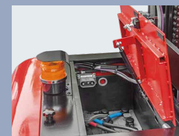
The rear hood can be removed easily to facilitate maintenance work on parts such as hydraulic unit, electronic control system and the motor