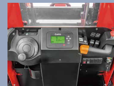
The FREE accelerator lever with sensor switch, as standard configuration, can prevent mis-operation during the work