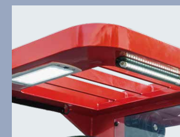
LED top lamp can provide bright operating environment