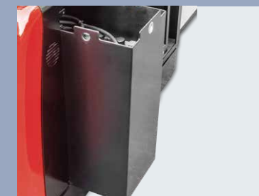
Battery side roll out