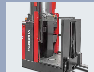
Order picker works only when the side barriers are all lowered